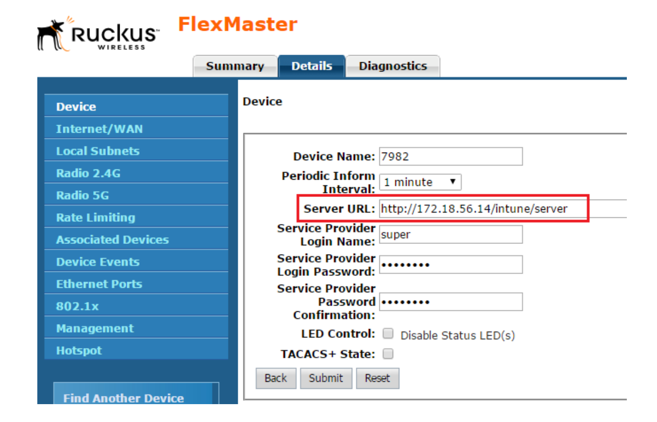
Figure 3: Device details